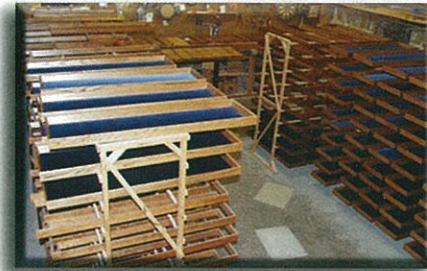
Oak and Cherry Blue Velvet Saber Cases in production